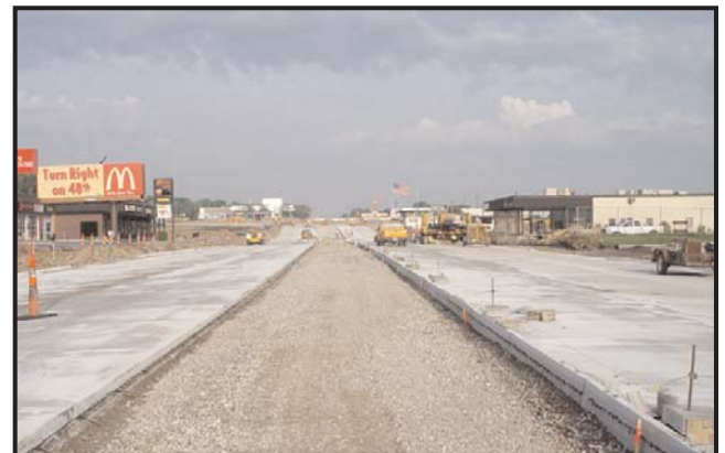
O Street at 52nd Street, looking west, May 23, 2006