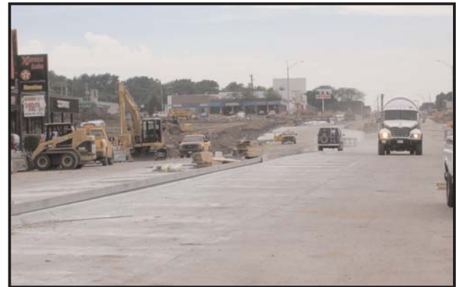
O Street at 52nd Street, looking west, June 5, 2006

It is anticipated that the water main work between 33rd Street and 44th Street will be completed by June 30th.